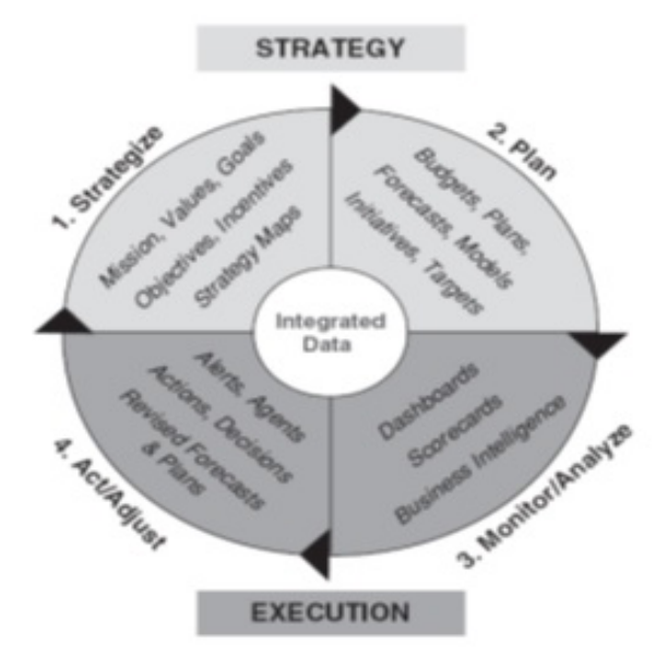
Figure 3 Framework of Business Performance Management [11]

The executives / leaders determine the main objectives of the business value and determine how to measure it. In this case, the executive / leader will determine the target and use the Key Performace Indicator (KPI) to produce information that shows the extent to which the department / division has succeeded in realizing the target set.